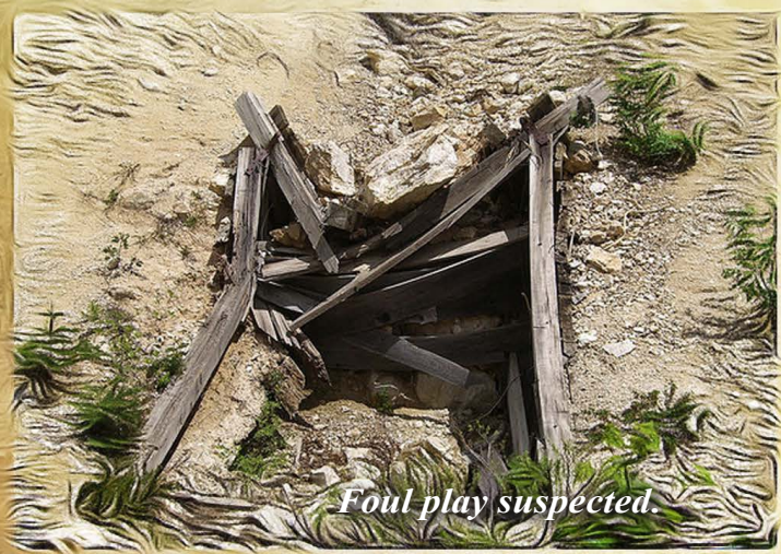
Grumpy presumed dead. Seen here; entrance to mine completely collapsed.

Beloved 5th dwarf Grumpy has been killed as a result of a cave-in at the mining facility where he worked. Luckily, dwarfs 1 through 4 and dwarfs 6 and 7 were all finished for the day. It is unknown why Grumpy was working so late at night.